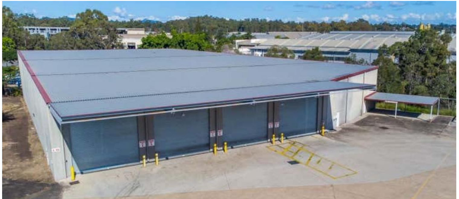
28 Purcell Place, AMIENS